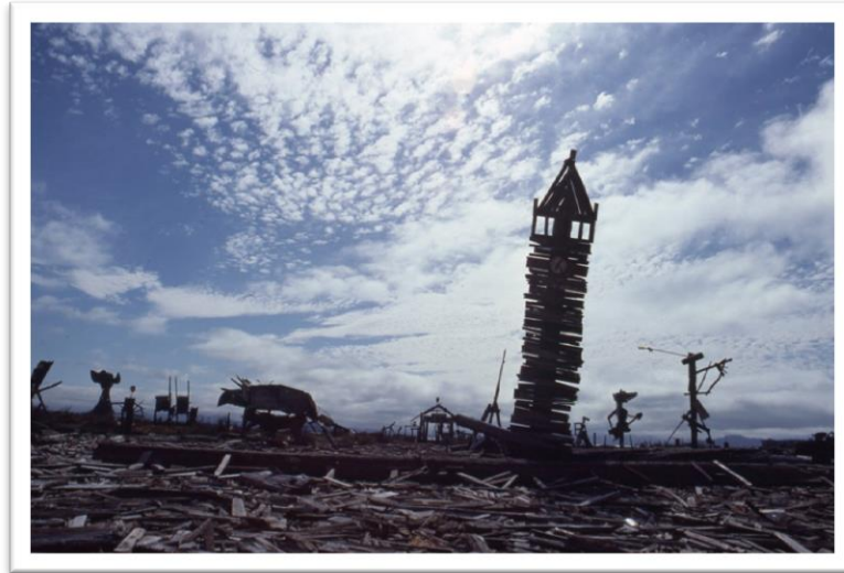
(Emeryville Mud Flats – Exhibit – “Hippie Modernism”)