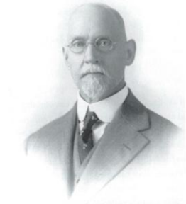
(John Galen Howard – 1923 Photograph)