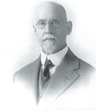
(John Galen Howard – 1923 Photograph)