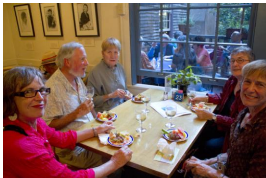
(Reception following "Arts in the Afternoon")

"Arts in the Afternoon" concerts and programs are complimentary and open to the campus community. Join us!