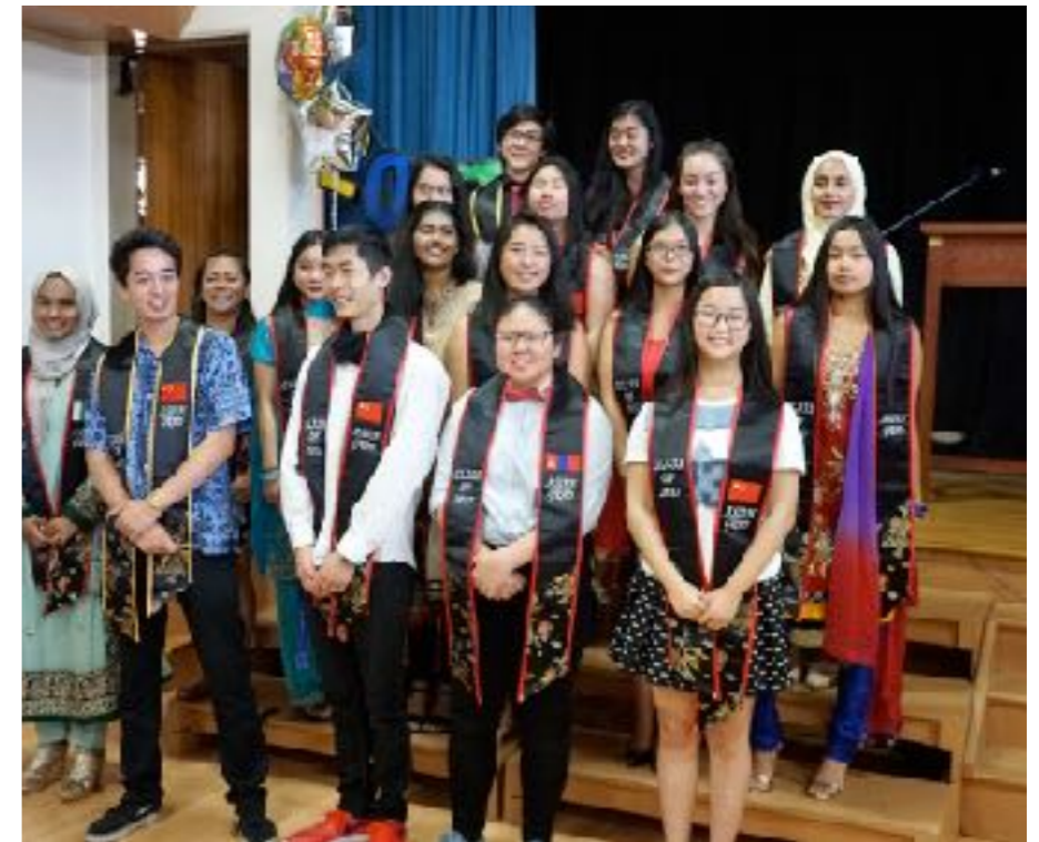
CULTURAL CELEBRATIONS & LEARNING COMMUNITY GRADUATIONS