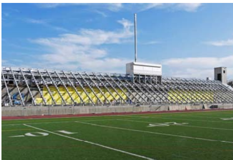
January 6, 2012