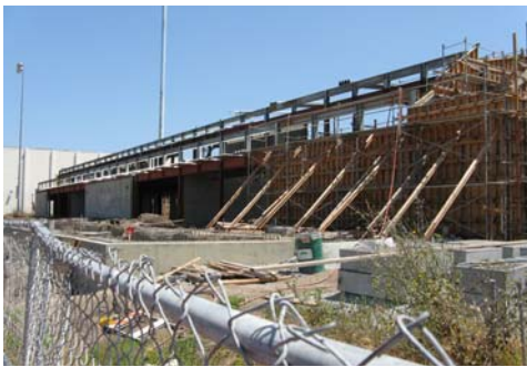
June 25, 2011

After unbelievable delays that deprived our student athletes a long-promised 2011 opening, the new Stadium is finally moving to completion. These photos show the rapid progress that has been made since the District started playing the contractor tough in October.