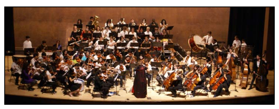
Berkeley High's Concert Band & Orchestra's Halloween Concert October 29, 2009.

Thanks generosity Berkeley voters in passing Measure A in 2006 (the BSEP property tax), BUSD is able to offer students a rich music education. The Winter Concert Series is a great opportunity to hear the results of the students' practice.